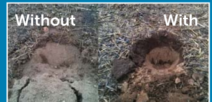
Don't miss the opportunity to link up subsoil moisture with opening rains