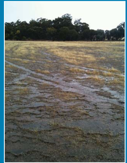
Stop runoff and capture valuable early season rains